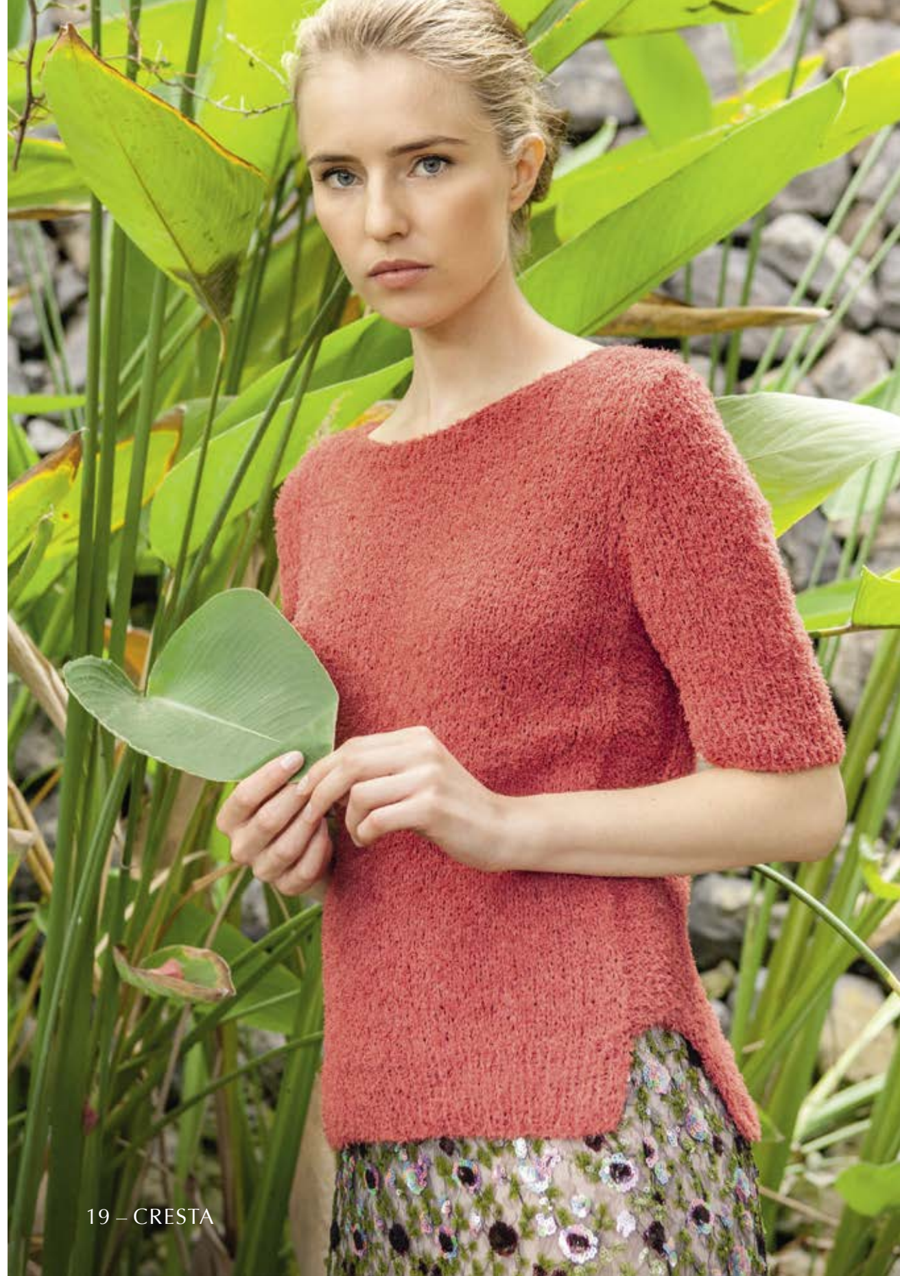
19 – CRESTA