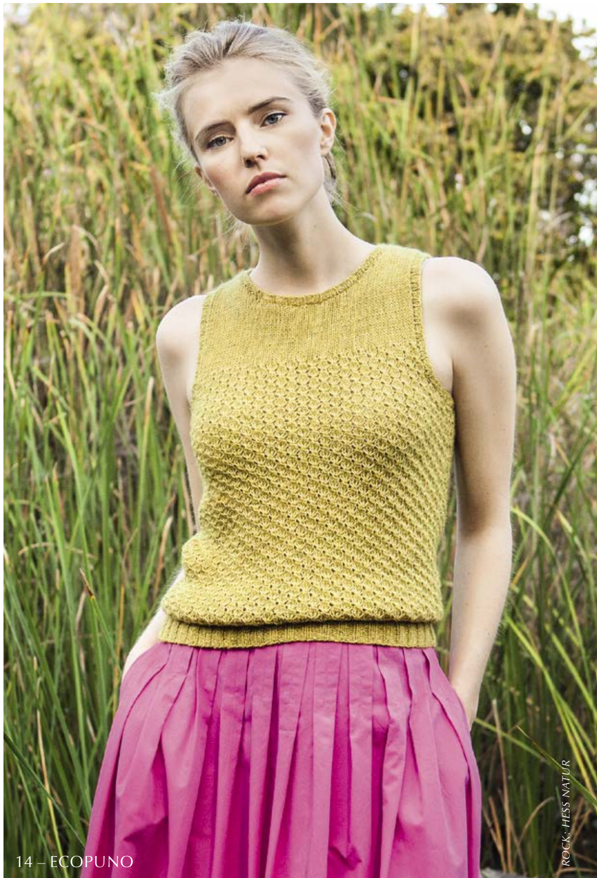
14 – ECOPUNO