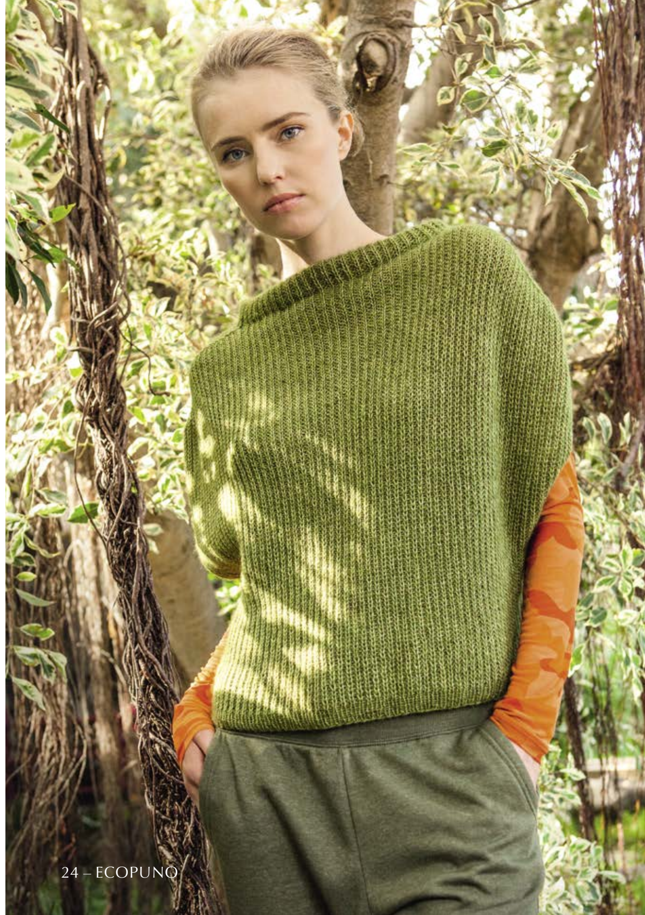
24 - ECOPUNO