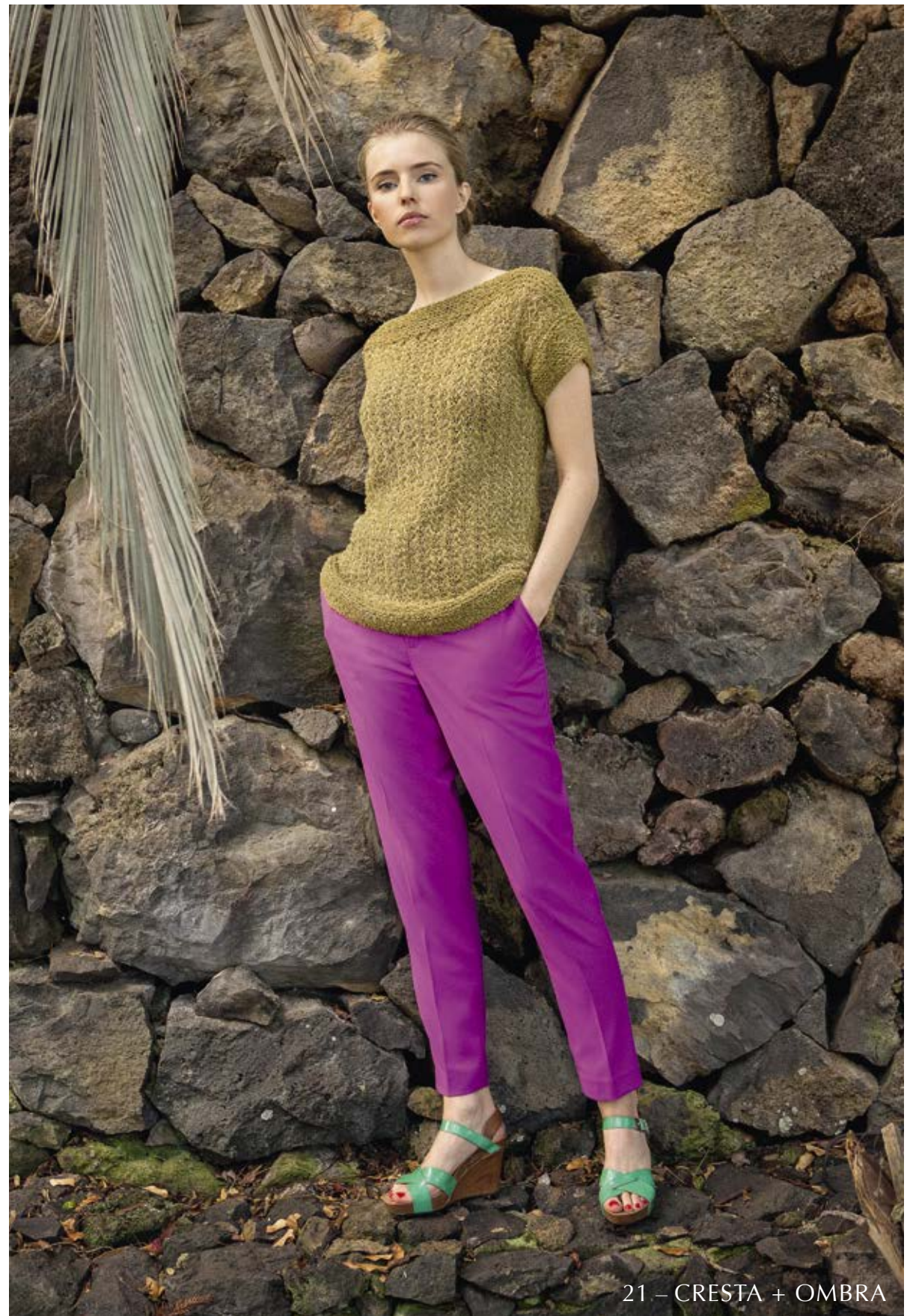
21 – CRESTA + OMBRA