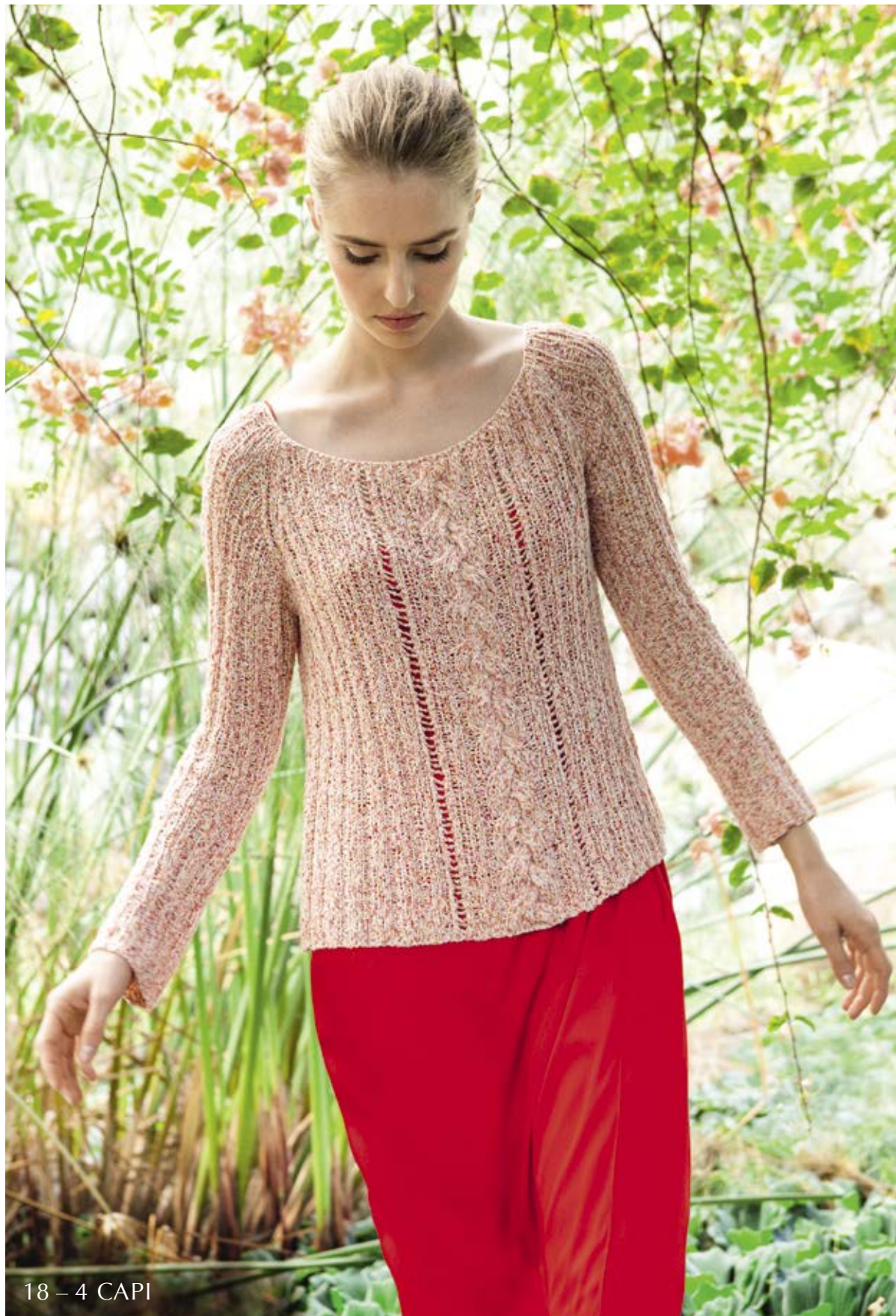
18 – 4 CAPI