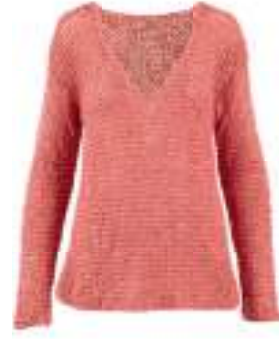
SECOND THOUGHTS PRIDE 40% linen, 32% cotton, 28% viscose