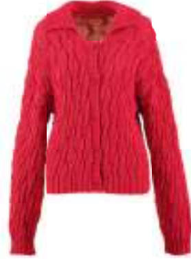
I-AM-LOVED JOY 50% organic cotton, 50% liocel