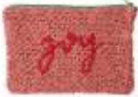
I-AM-JOYFUL PRIDE 40% linen, 32% cotton, 28% viscose