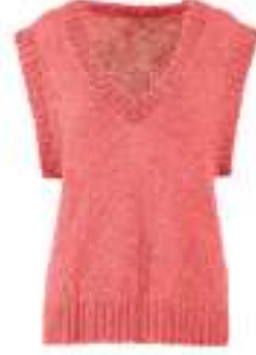
TRUE LOVE PRIDE 40% linen, 32% cotton, 28% viscose