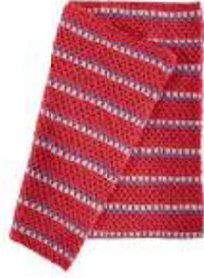
SUNNY SUMMER PRIDE 40% linen, 32% cotton, 28% viscose