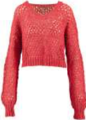
BE HUMBLE PRIDE 40% linen, 32% cotton, 28% viscose