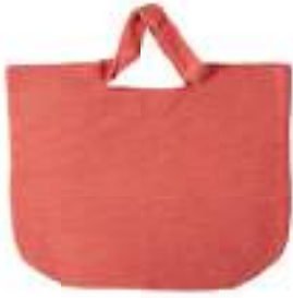
SUMMER SELF-CARE JOY 50% organic cotton, 50% liocel