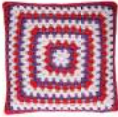
BEAUTIFIL BLOSSOM JOY 50% organic cotton, 50% liocel