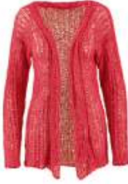
YOU ARE WORTHY PRIDE 40% linen, 32% cotton, 28% viscose