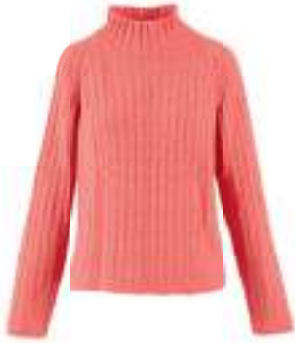
I-AM-BLESSED HAPPINESS 65% cotton (pima), 35% nylon