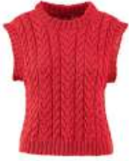
PRETTY PERFECT SUNSHINE 100% organic cotton (mercerized)